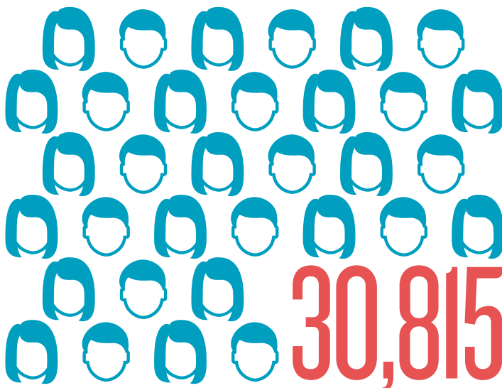
30,815 young people under 25 on live register for 12 months or more