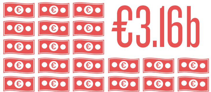
The cost of youth unemployment is €3.16 billion.

The National Youth Council of Ireland is the representative body for national voluntary youth work organisations in Ireland. It represents and supports the interests of voluntary youth organisations and uses its collective experience to act on issues that impact on young people.