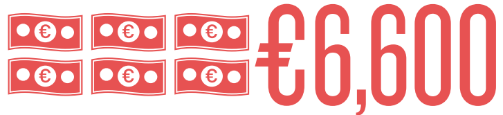
In Sweden the cost of youth guarantee is less than €6,600 per participant