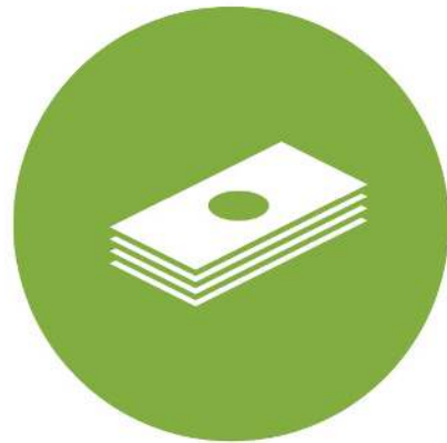
YOUTH SECTOR FUNDERS