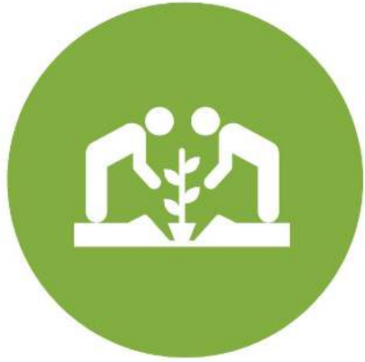
GRASSROOTS YOUTH ORGANIZATIONS