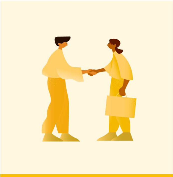
YOUTH PROGRAM SUPPORTS (RESEARCH + EVALUATION)