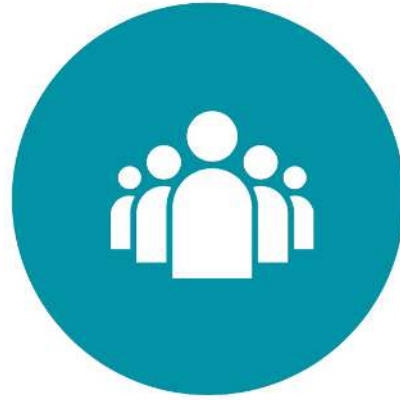
LARGE YOUTH ORGANIZATIONS