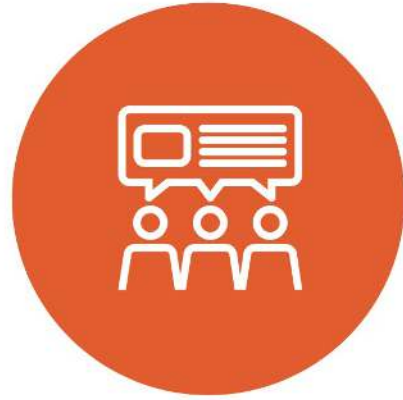
YOUTH SECTOR COLLECTIVES